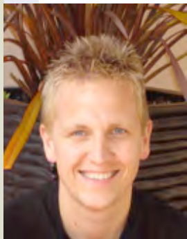
Our newest Tall poppy

Comments and suggestions to: justin.gooding@unsw.edu.au